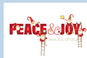
Joyful Santas FE490 | Children's Cancer Institute