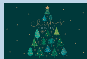
Beautiful Trees TR474 | Children's Cancer Institute