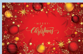
Christmas Baubles BA427 | National Breast Cancer Foundation