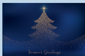
Shimmering Tree TR422 | National Breast Cancer Foundation