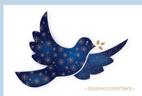
Elegant Dove DO419 | Children's Cancer Institute