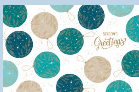
Delicate Baubles BA435 | Children's Cancer Institute