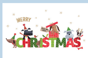
Festive Puppies FE402 | National Breast Cancer Foundation