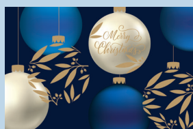
Eucalyptus Baubles BA446 | National Breast Cancer Foundation