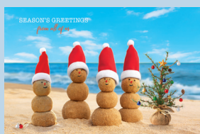
Beach Team FE459 | National Breast Cancer Foundation