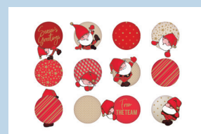
Santa's Greetings FE477 | National Breast Cancer Foundation