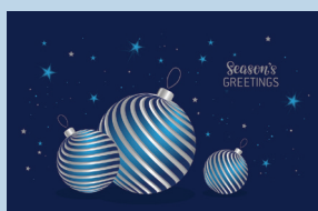
Glowing Baubles BA376 | National Breast Cancer Foundation