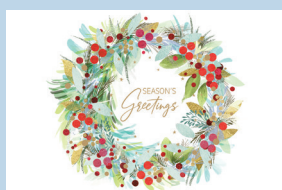
Gorgeous Wreath WR441 | Children's Cancer Institute