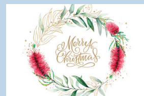
Australian Wreath AU408 | National Breast Cancer Foundation