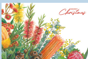
Floral Greetings AU455 | Children's Cancer Institute