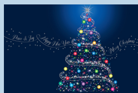
Fabulous Tree TR430 | Children's Cancer Institute