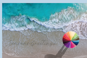
Summer Holidays FE382 | Children's Cancer Institute